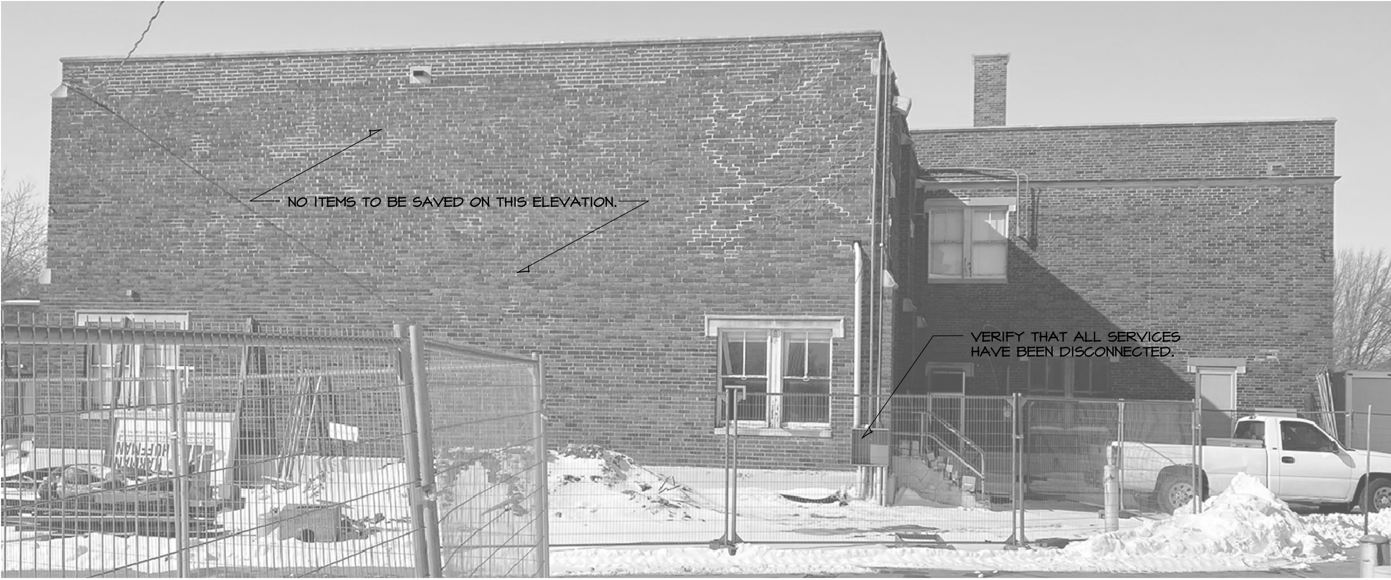
SALVAGE COMPONENTS D EAST ELEVATION SCALE: N.T.S.