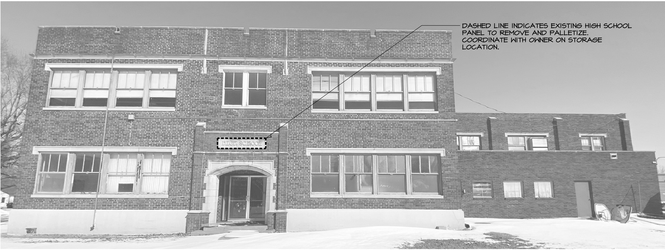
SALVAGE COMPONENTS B SOUTH ELEVATION SCALE: N.T.S.